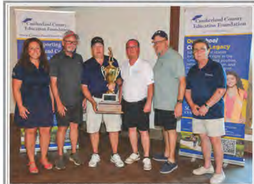
2026 School Counts! Golf Classic Winners