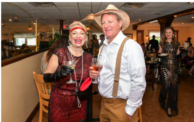
Speakeasy patrons enjoyed the themed event in style.